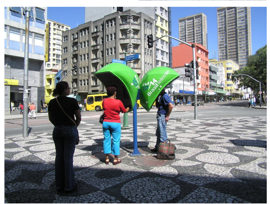
Photos 1-3. Clockwise from top left: Belgium, United Kingdom, Brazil.