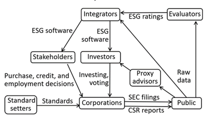
Figure 1. The ESG Information System<sup>47</sup>

"Standards," as used here, are definitions of the data to be collected. For example, this is the GRI standard for Direct (Scope 1) greenhouse gas ("GHG") emissions: